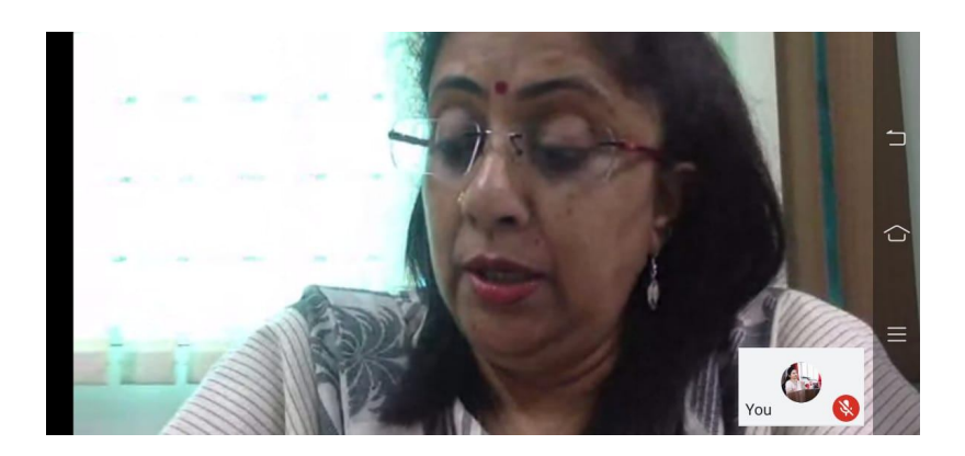
Figure 1: HEAD, DEPT OF LAW ADDRESSING THE PARENTS